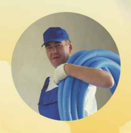
FACILITIES Electrical Fittings: Conduit copper electrical wiring for all light & power points Air-Conditioning: Air-conditioners in all bedrooms. Provision of copper conduits and drainage pipes for split air-conditioning in living room 100% power back-up & 24X7 security