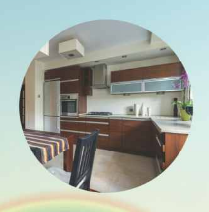
HALF MODULAR KITCHEN Flooring: Ceramic tiles Dado: Ceramic tiles above working platform, rest acrylic emulsion paint